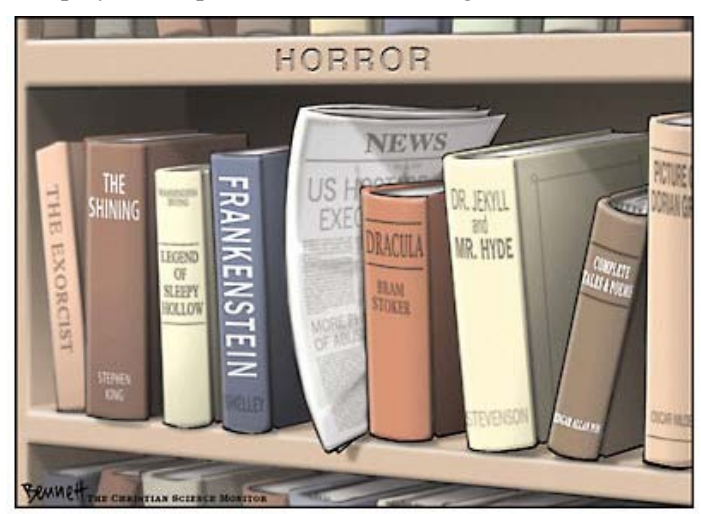
Figure 1. The Horror Show, by Clay Bennett, The Christian Science Monitor , May 13, 2004, page 8.

expressing pictorial simile. As another example, if the components depict things that can be seen as incompatible, the alignment can express an oxymoron in pictorial terms. A quick look at the following cartoon (figure 1) may give us a good sense of how image alignment figures in pictorial representation. This cartoon features a pattern of image alignment apt for expressing pictorial simile. A newspaper is placed in alignment with books on a shelf. The newspaper is positioned in the middle of this alignment, and the books that flank it on both sides are all well-known horror novels. The front-page headline of the newspaper indicates that the news is about the United States. News and horror stories are of different narrative styles and presumably belong in different genres; however, the alignment suggests some similarity between the components. This cartoon, then, suggests that news about the US is similar to a horror story. The word "HORROR" engraved on the front of the upper shelf further supports this reading. Following the standard A IS LIKE B format of simile, this pictorial simile can be labeled AMERICAN NEWS IS LIKE HORROR NOVEL (see Teng, 2006: 73–74 for further discussion of this example). The expressiveness of image alignment as shown in figure 1 is not confined to pictorial representation, but also plays an important role in the design of multimodal metaphor.