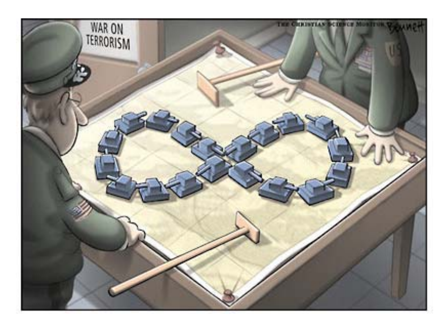
Figure 5. Terrorism Strategy, by Clay Bennett, The Christian Science Monitor , September 13, 2004, page 8.

As shown by the above examples, image alignment can take many forms. It can be linear along the horizontal axis (figures 1, 2, and 3), a twodimensional pattern (figure 4), or a curvilinear form (figure 5). Despite the diverse forms it can take, alignment of any of these forms can be strategically deployed in the construction of multimodal metaphors through its central use for connecting a set of pictorial components in a way that is apt for expressing a certain idea. Figures 2-5 show how this strategic deployment may work. In figure 2, the two pictures of garbage cans are essentially the same except the contrast in image resolution between them. This contrast is a design choice made within the framework defined by the overall alignment. In figure 3, the dove, unlike the rhino and the panda, cannot properly be labeled "endangered species"; it is much smaller in size than the other two animals; and, more important, it is symbolic of peace. This contrast, again, is a design choice in the framework defined by the overall alignment. It is worth noting here that alignment is defined in terms of iconic features such as size, orientation and distance, and, as a result, the symbolic representation in figure 3 is anchored to the alignment via the iconic function of the pictorial components. In figure 4, the worshipper at the center of the alignment is in stark contrast to the rest of worshippers