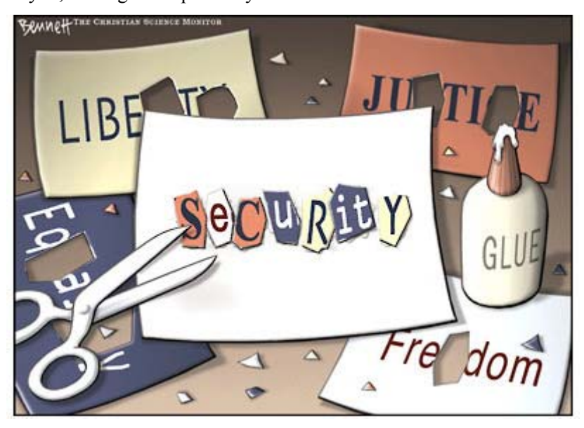
Figure 7. Homeland Security, by Clay Bennett, The Christian Science Monitor , October 11, 2001, page 8.

that the symbols printed on the background sheets were "Liberty," "Justice," "Equality," and "Freedom," but, because of the clipping and pasting, they are now in bad shape. This design suggests the following interrelated interpretations: (a) the cuttings metaphorically mean that liberty, justice, equality, and freedom have been severely and dangerously compromised; (b) the clipping and pasting metaphorically mean that liberty, justice, equality, and freedom have been curtailed in the service of security; and (c) the jumbled form of "SeCuRitY" metaphorically mean that security measures have been badly managed. On top of all this, the fact that the five sheets of paper are not well arranged suggests the metaphorical reading that issues concerning liberty, justice, freedom, equality and security have not been handled carefully. It is worth emphasizing that disorder need not be a poorly thought-out design choice. It can be carefully crafted so as to suggest that an action has been performed. The disarray in figure 7 testifies to such a design choice. It is the implied actions, rather than the things portrayed, that figure importantly in this construction of multimodal metaphor.