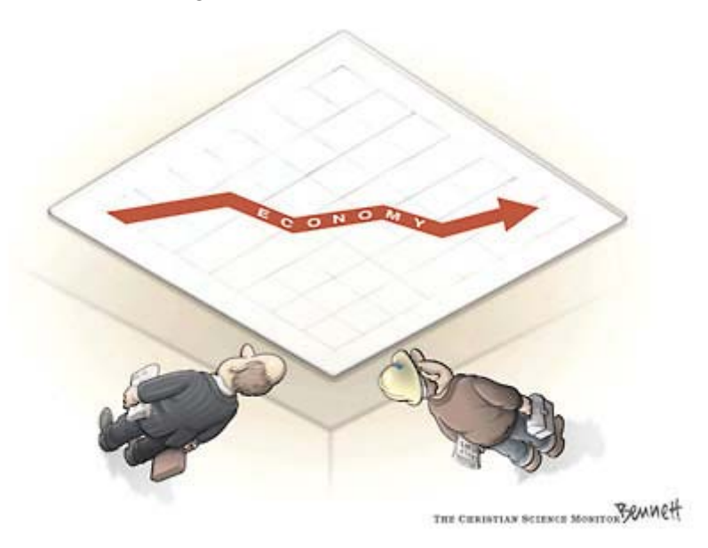
Figure 6. It's an Escher-type Economy, by Clay Bennett, The Christian Science Monitor , November 5, 2003, page 8.

conventional assumption that a growing economy will eventually benefit all people is not, or no longer, valid.